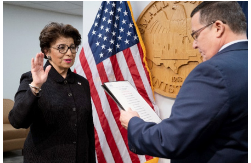
Swearing-In of SBA Administrator Jovita Carranza